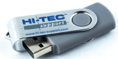
The software for the PC application can be found on the USB stick.